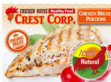
Food and beverage label